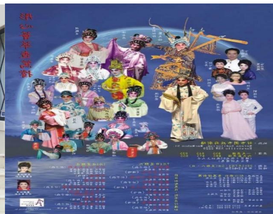
(Cantonese Opera Performance Poster)